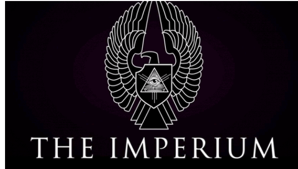
Figure 2: The Symbol of the Imperium

@28:45), it has, in The Mittani's own words, become a 'powerful' symbol. This image, referred to as the Black Eagle, clearly and directly references well-established imperial symbolism from a variety of historical contexts, the eagle a heraldic device widely associated with power; and TMC now offers t-shirts bearing this device for sale, tabards for the loyal and the interested alike.