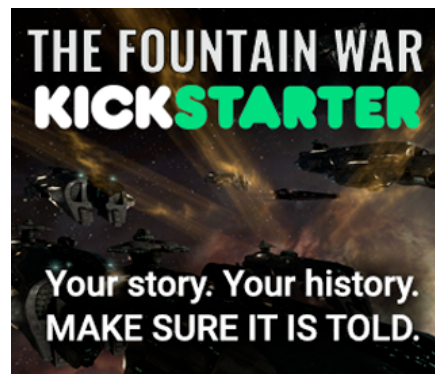
Figure 3: Banner ad for the KickStarter for the book