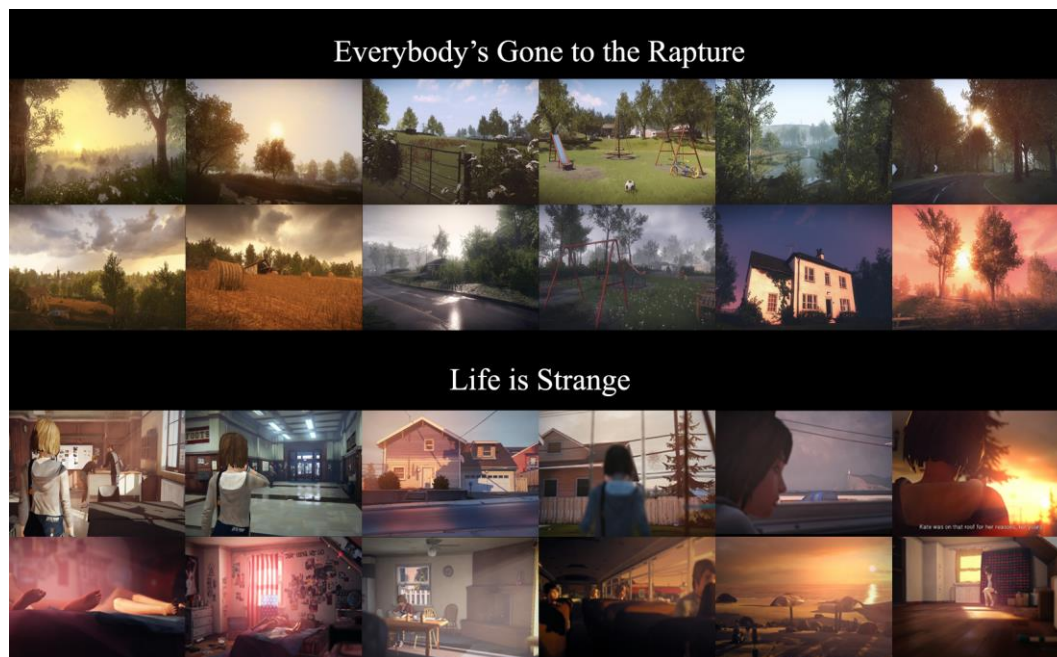
Figure 2: Example thumbnail-style screenshots that highlight use of colour and light. Above, an overview of the external colour and light progression in Everybody's Gone to the Rapture and, below, examples of scene lighting in Life is Strange .