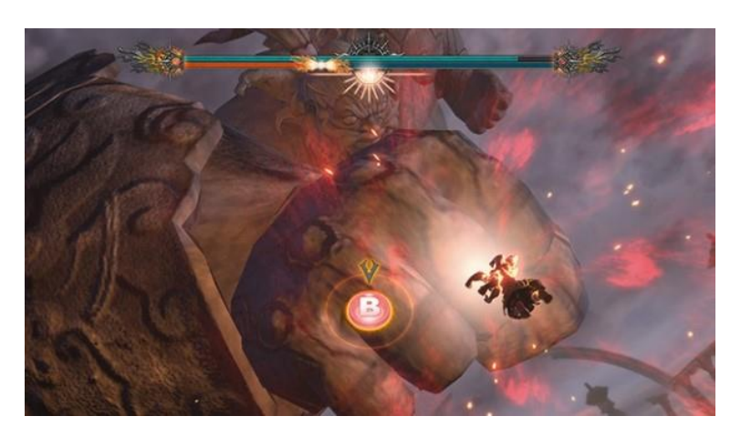
Figure 3: Asura challenges a much bigger foe.

Example: In the game Asura's Wrath (CyberConnect2 2012), the main character faces an enemy many times his size in a contest of strength. The player must pump the button in order to defeat the enemy, illustrated by Figure 3.