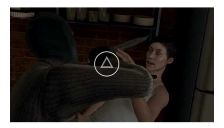
Figure 2: Madison must survive the burglar's attacks.

Example: Madison, one of four controllable characters from Heavy Rain (Quantic Dream 2010), should avoid being stabbed by a burglar/assassin at her apartment on a series of risky maneuvers that require agile reflexes in order to survive. The player must press the button in a short period of time for the action to be successful, see Figure 2.