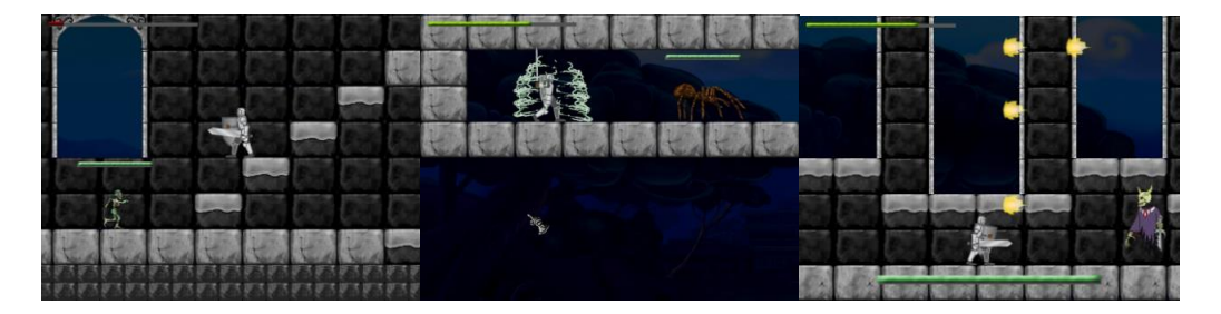
Figure 4: Prototype's screenshots.

As an object of research, a side scroller game with a medieval dark fantasy theme was developed, as shown in Figure 4, in which the player could perform eight different actions, besides the actions of walking and jumping. The eight actions were defined according to the categories of effort, duration and context, in order to adapt to the isomorphic interaction technique patterns and the theme of the game described in the game concept. These are: attack, 3 hit combo, guard, throw spear, reflect projectile, activate lever, escape from spider web, defeat the Ghost King.