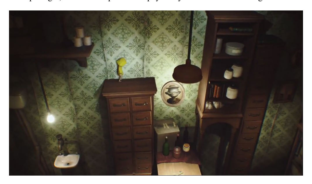
Figure 2: Six climbing a cabinet in Little Nightmares .

Little Nightmares also manipulates the player's agency through Physical Parameters throughout the game, though these are often more of a static nature. Six, the main character, is much smaller than both the game-world and the enemies (see Figure 2), which consistently both constrains and affords player action, while equally shaping their expectations. Due to her size, she is, for example, able to escape through small passages, while it is impossible to physically confront the much larger enemies.