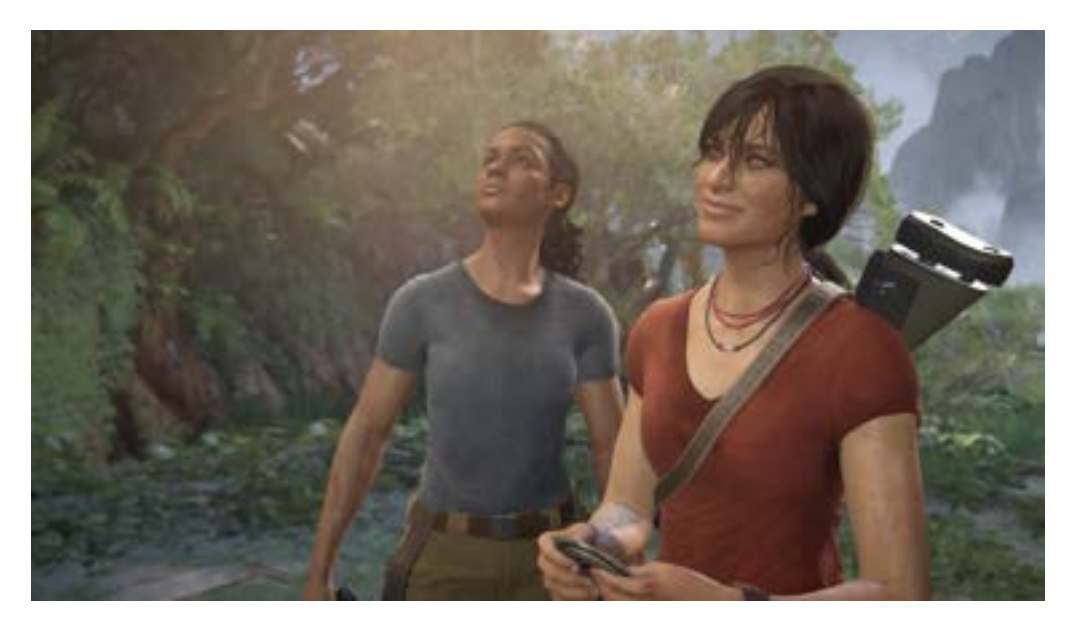
Figure 4: A screenshot from Uncharted: The Lost Legacy showing Nadine and Chloe, the main characters in this game.

From the first game, a player can see a change in the inclusivity of women in games as well as how the game treats these characters. By the fourth Uncharted game, there is a woman in a position of power—Nadine, the owner of a private army which Nathan is fighting during the game. Nadine is also a complex and strong female character, and she is a woman of color. While the inclusion of a racial minority as an antagonist is somewhat problematic, Nadine becomes much more in The Lost Legacy where she plays alongside Chloe as one of the heroines of the story (Figure 4).