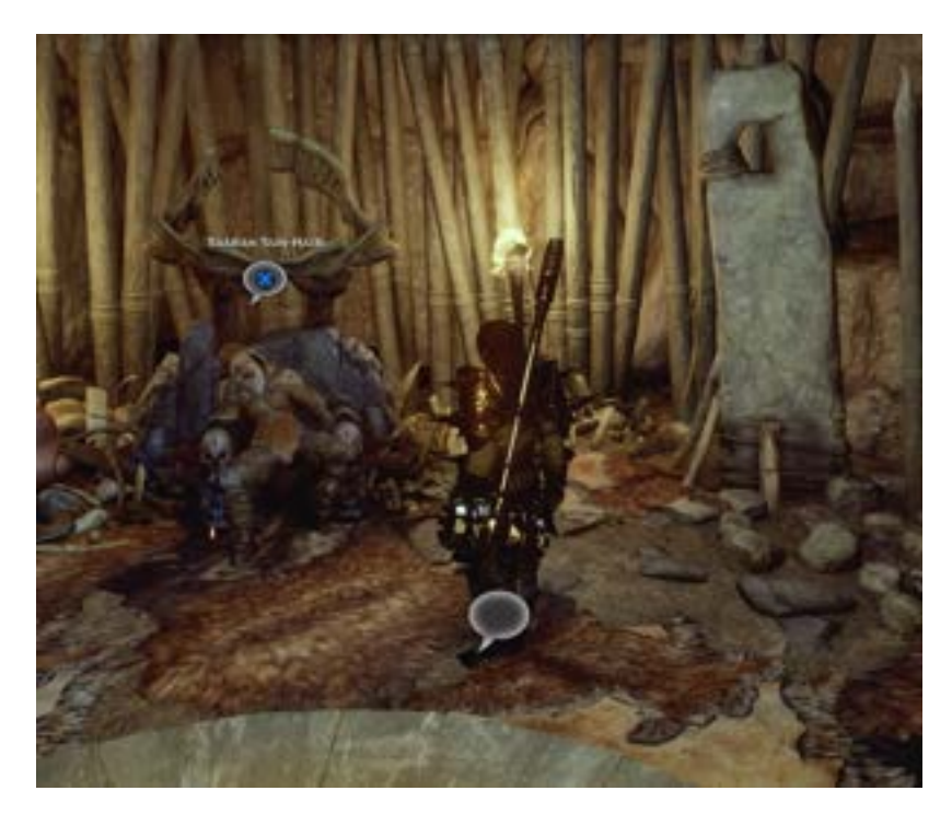
Figure 3: A screenshot from Dragon Age: Inquisition , the "Jaws of Hakkon" DLC, showing one of the many women in positions of power throughout this game.

the Orlesian Empire—one of the two states in which the player spends a lot of time is a woman in a position of power as well. These are two examples, however, there are the plethora of women in power and prestige throughout the world of Dragon Age: Inquisition. The representation of a variety of women is notable in this installment of the series.