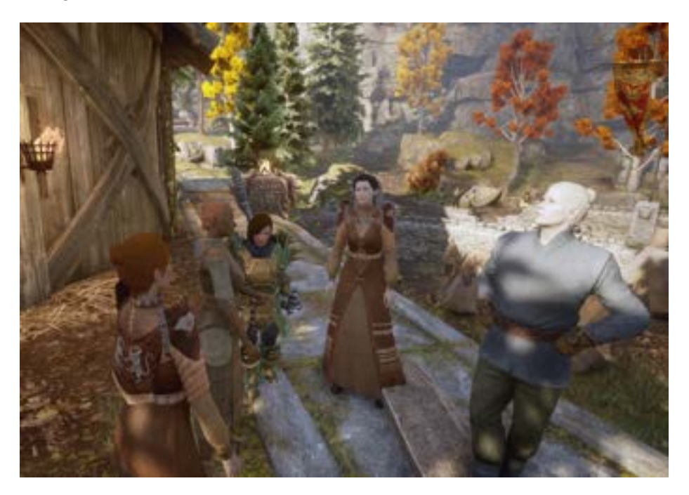
Figure 2: A screenshot from Dragon Age: Inquisition at one of the first towns which the player encounters (the Crossroads in the Hinterlands), showing diversity among the character models.

of the PC or the storyline. Companions and party members are of varying skills and abilities as well as backstories. The scientist to whom the player gives materials for research is a woman as is the enchanter whose skill is spoken of highly. Each feminine character becomes their own individual without the inclusion of sexist questions or actions against them.