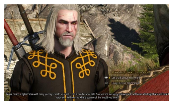
Figure 3: Geralt's responses to the man's plight: "Where should I search for your son?"; "Let's talk about my reward" (initiate negotiation); "Sorry, busy at the moment".

One of the ways such a boundary was drawn was in Geralt's avatar. Geralt as the player's vessel is significant because the repetitious and evocative narrative force of Geralt's oppression permeated my play style. The stereotype that Witchers have an inherent and insatiable love of money is feed for their public hatred and inferior social standing. Financial negotiations almost always arise when Geralt accepts quests from characters, allowing the player to barter via a slider that accommodates the NPCs (non-playable characters) "annoyance level." NPCs were sensitive towards Geralt's negotiations and did not hesitate to comment on the social significance of the transactions with tongue-in-cheek comments, like: "I know Witchers don't work for free." Other times, the player can choose to insist on a reward or offer gratuitous services, a decision seemingly free and up to the player's discretion. If engrossment is active, every previous encounter goes on to shape the next one. Times where I was treated crudely provoked aggression, whilst graceful encounters brought on more sympathy.