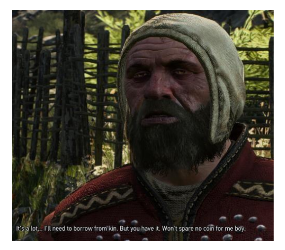
Figure 4: The man's response to a high barter: "It's a lot... I'll need to borrow from kin. But you have it. Won't spare no coin for me boy.

Figure 3: Geralt's responses to the man's plight: "Where should I search for your son?"; "Let's talk about my reward" (initiate negotiation); "Sorry, busy at the moment".