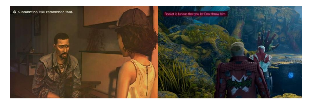
Figure 1: "Clementine will remember that." (left)

On-screen textual commentaries act as a kind of ludic feedback—rewarding, acknowledging, or reproaching a player's decisions and subsequent effects on a storyline and its characters. These intra-game messages recall one of Salen and Zimmerman's fundamentals of 'meaningful play' as such feedback provides an imbued weight to players' decisions.<sup>5</sup>