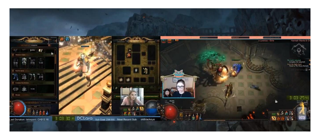
Figure 2: DCLara uses avatar-based MTXs during broadcasted race event.

possibilities attributed to her or him through the system of game rules, decides to participate in a different mode of expression. Killing monsters, collecting items and progressing through the subsequent areas of the game is in such occurrence interrupted by taking up on the new type of agency. Exploration of the aesthetic as finding an own voice fully comes to realization especially in cases of streamed play on platforms such as Twitch.tv, where the temporal constraints of play activity make the particular players' choices more meaningful. As an example, I would like to refer to the particular case of all-female live race organized in the series of popular community-based events, where female streamer known as DCLara obtained significant advantage over her competitors. At one time, she paused her progress, opened the MTX interface and spent some time adjusting the look of her in-game avatar (see Figure 2).