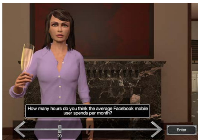
Figure 3: Player estimates the number of hours the average user spends on mobile Facebook in a month

This is an example of an anchoring bias vignette. In this case, the externally provided anchor is Terry's 30-hour estimate of the time she spends on mobile Facebook each month. The player is first prompted to answer whether (s)he thinks that the average mobile Facebook user spends more or less than 30 hours a month on the app, increasing the selective accessibility of the anchor to the player and establishing which direction the player will be adjusting from the anchor (i.e., higher or lower than the anchor). The player is then asked to estimate the number of hours the average user spends on mobile Facebook in a month. By analyzing the player's response relative to the anchor value (30 hours per month) and to the correct answer (11 hours per month; Sternberg 2013), the player's anchoring bias can be assessed by the game mechanics ( [Phase 2] Bias measurement ). The closer the player's answer has been "pulled" toward the anchor of 30 hours and away from the correct answer, the more anchoring bias the player has demonstrated; the closer the player's answer is to the true value of 11 hours, the less anchoring bias the player has demonstrated. The player's measured bias serves as the basis for the feedback that the player will receive during the AAR for Episode 1.