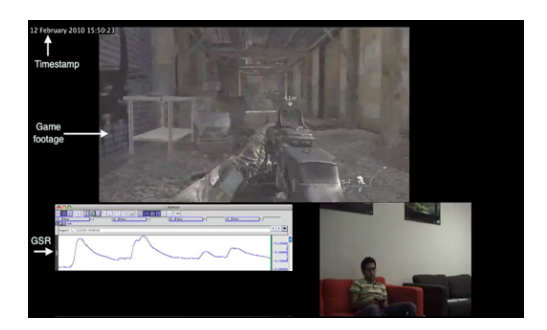
Figure 1: Example screenshot of the gameplay video.

The experiment was conducted in our game testing laboratory, equipped with a Sony PlayStation 3, a Sony 40" flat screen TV, a Sennheiser wireless microphone to capture participants' verbal comments, a Sony Handycam video camera to capture the player's face, and a BIOPAC system to capture physiological data. All data is synchronized in a single screen for live viewing (Figure 1) in isolated observation room, and also captured for later analysis at the observation-based evaluation stage. The playroom is modelled in the style of a typical living room and participants were seated approximately two meters from the TV and camera.