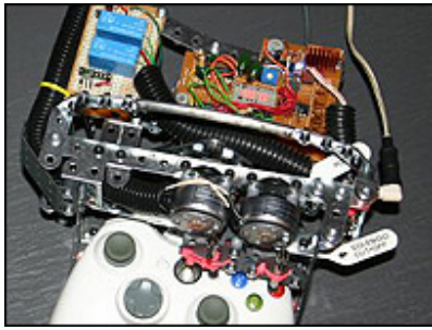
Figure 2: The machine automatizes the process of getting some of the achievements in Perfet Dark Zero.

The paper will also address the history of achievements, including Activision's patches for their Atari 2600 games where gamers could document certain in-game achievements by taking pictures of their TV-screens and send the photos to Atari whereupon they would receive a fabric patch (see fig. 3).