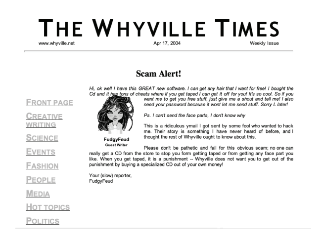
Figure 2. Excerpts of a Whyville Times article on cheating.

forms of cheating on Whyville, including the provocative "stealing from Grandma" referenced in the title of this paper.