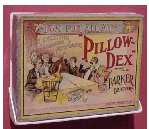
Figure 4: Typical of packaging of the day, Pillow-Dex shows multiple generations enjoying the game.

One of the most intriguing and little-known aspects of the early board game industry was the predominance of women in the production process. The following account, from The Game-Makers , a history of Parker Brothers, sets the stage for what would come to be called "The Pastime Girls," after Pastime Puzzles, the jigsaw division of the company [18]: