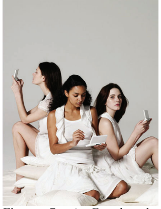
Figure 7: A French ad campaign for the DS Lite.

While at this particular historical moment, the Hegemony of Play is the dominant force in the cultural production of games, we are beginning to see signs of subtle but tectonic shifts. This paper was written on the heels of the console frenzy of Christmas 2006, also at a time when the Internet has afforded an alternative distribution channel whose impact is only beginning to be understood. Sony and Microsoft placed their bets on the fervent loyalty of "gamers" in search of higher polygon counts of the same fare with their Playstation 3 and Xbox 360 repsectively, the number 3 console maker is staging a quiet revolution. Few paid notice to the re-branding of the "Gameboy" to the "DS" that took place in 2004. Yet advertising campaigns, in addition to the name-change, showed Nintendo setting its sights on a new population of players. (Figure 7) With the release of its new Wii console system,, Nintendo has stated openly and unabashedly, and demonstrated with both its new product development efforts and advertising campaigns, that it intends to diverge from the "path of least resistance" and follow in the footsteps of George Parker to return game-playing to a more inclusive activity that embraces diverse interests and embraces the whole family.