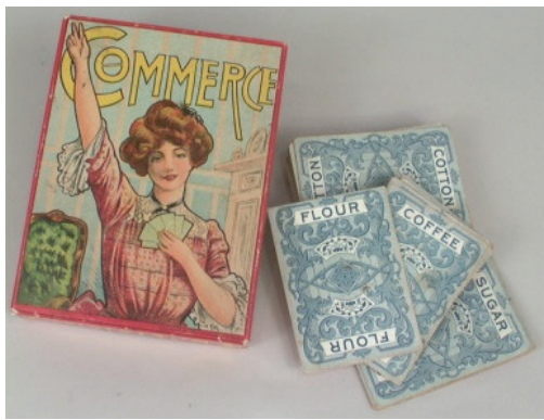
Figure 3: Commerce (Ottoman & Lith 1900)

While the people represented on the boxes of these games were generally white and middle class, they spanned both genders and a wider range of ages than do typical video game packaging and ads of today. The convention of showing people playing the game used on the packaging of the period provides some insight into the way in which the "technology" of the board games influenced their players and their role in society. The Sociable Telephone-A Game for the Smart Set, designed to teach etiquette for the new communications technology, features a smiling Victorian lady (Parker Bros. 1902); and the box cover for the stock market game Commerce shows a woman holding a trading card high up in the air. (J. Ottoman & Lith 1900) (Figure 3) Ads for Pillow-Dex, an indoor sport utilizing a kind of balloon, show Victorian ladies in full regalia knocking the object into the air. (Parker Bros. 1897) [18] (Figure 4) While there are currently no videogames based on women's sports, the board game industry of over 100 years ago, in recognition of the game's popularity among both men and women, created The Game of Basket Ball with an all-female cast. (Chaffee & Selchow & McLoughlin Bros. 1898) [8]