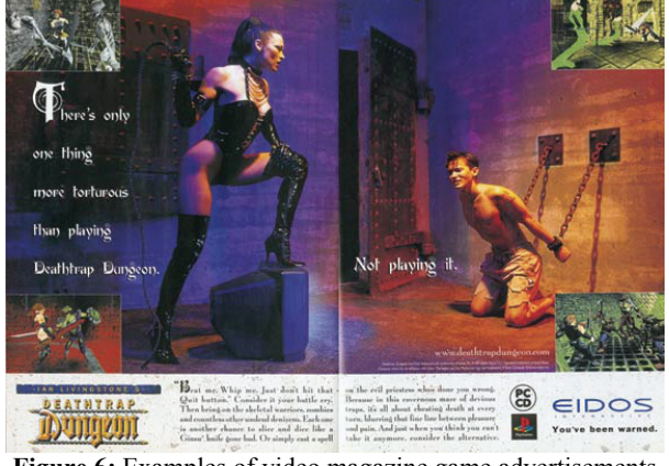
Figure 6: Examples of video magazine game advertisements.

Representation of women is symptomatic of a much larger problem: the games themselves are unwelcoming to those not considered "gamers." Indeed in many respects the digital playground is shut off to "minority" players entirely, whether in terms of game creation, game technologies, or game play, whether merely in terms of creating domains that are exclusively male, or through discriminating or alienating practices of players themselves.