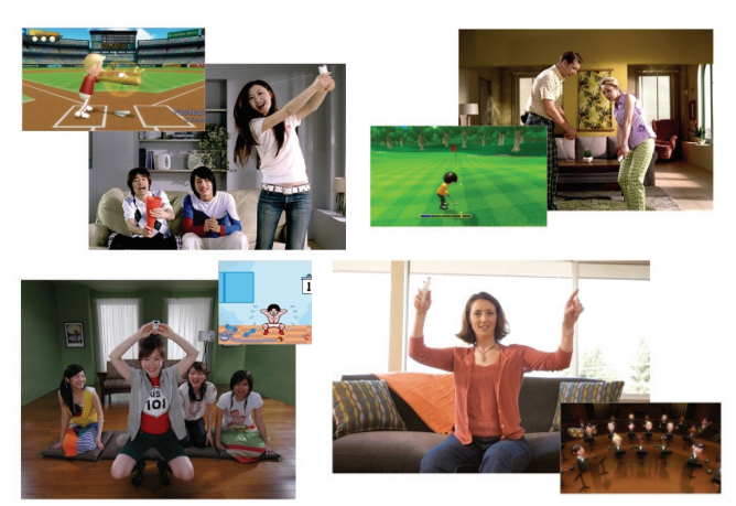
Figure 7: Assorted pre-release ads for the Nintendo Wii.

advertising campaigns harkening back to board game packaging of old show a diverse array of players engaging primarily with each other, rather than screenshots showing off graphics, as is the common practice with other systems. (Figure 7) Nintendo, once the undisputed giant of the game industry, has turned its back seat position in the Hegemony of Play into an asset. Rather than racing to create the fanciest graphics with the same old game mechanics, Nintendo has bet on new audiences and accessible game play, cultivating an audience of girls, women, adults and Baby Boomers, in other words, everyone except the "gamer" demographic described above.