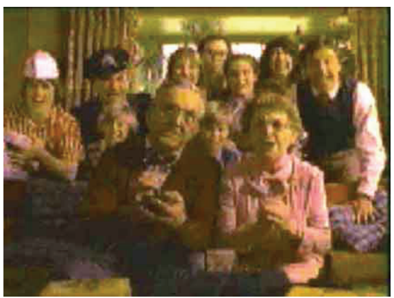
Figure 8 . Playing Atari draws a crowd.

and the growing crowd of players makes sense. They wanted to show that not only were videogame systems so easy that a child could operate them, but that they were so easy that a bumbling uncle, an out of touch grandfather, or a self-absorbed babysitter could not only operate the games, but could actually enjoy them just minutes after sitting down in front of them. Spigel notes that Warren Susman "argues that the public often resists new technologies" [13]. She adds, "this resistance can also help determine the form that communications media take" [13]. This is, of course, the same trajectory that Atari attempted to take when they introduced videogames to the mainstream public and the trajectory that Nintendo is attempting to follow. Make the strange familiar and make it as user-friendly to as many people as possible.