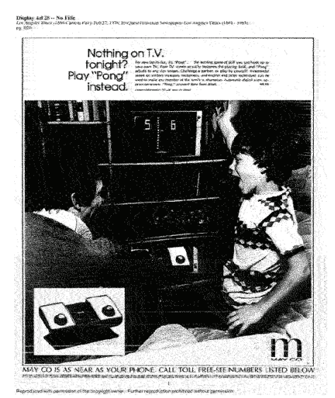
Figure 3: An ad from the February 27, 1976 LA Times shows a father and son playing Pong [11]

machine (see figure 3). The son has his hand raised in the air in triumph and with his mouth open, presumably shouting in victory after having beaten dear old dad. The text above the image asks the question, "Nothing on T.V. tonight?" and gives the advice, "Play 'Pong' instead." Another line from the ad copy reads, "For new family fun, it's 'Pong' ...the exciting game of skill you just hook up to your own TV. Your TV screen actually becomes the playing field, and 'Pong' adjusts to any size screen." The text ends, "Automatic digital score appears on screen. 'Pong' anyone? New from Atari. 99.95"