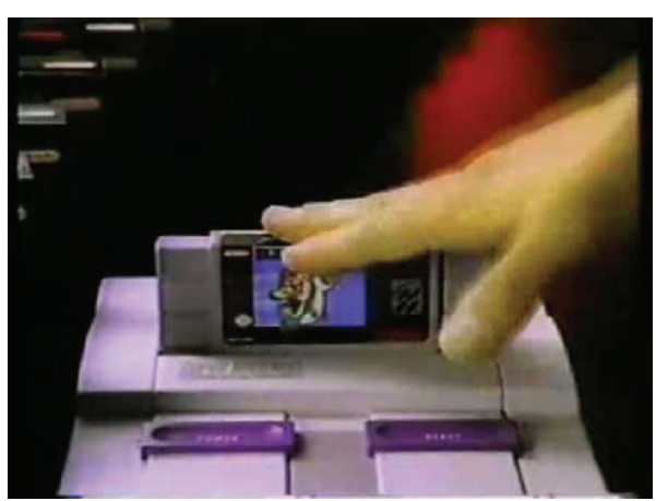
Figure 6 . Plugging the Atari 2600 into the wall.

Using advertisements as ways of educating the public on how to use a new device was not unique to videogames. In her analysis of the early depictions of television, Lynn Spigel notes that these information ads were common in coverage of televisions and suggests that these early depictions are markers of a phase in which "...magazines, advertisements, newspapers, radio, film, and television... spoke in seemingly endless ways about [a medium's] status as domestic entertainment" [13]. She suggests that, "By looking at these media and the representations they distributed, we can see how the idea of [a medium] and its place in the home was circulated to the public. Popular media ascribed meanings to [a medium] and advised the public on ways to use it [13].