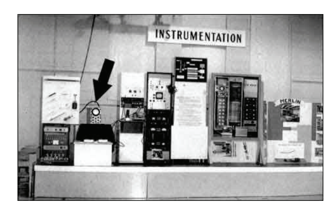
Figure 1: The BNL Instrumentation Division's Visitor Day display from 1958 showing the oscilloscope and electronics which ran the Tennis For Two video game (below arrow). [5]

until 1972 when Magnavox took an exclusive license on Ralph Baer's concept and began selling the system as the Odyssey and another company, Atari, would begin creation their own videogames [12, 6].