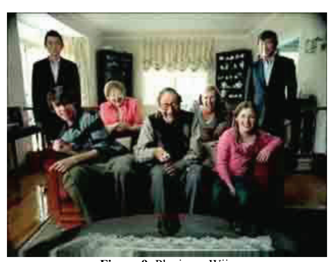
Figure 9 . Playing a Wii also draws a crowd.

The fact that women or senior citizens did not seem to take up the joystick indicates that advertisers cannot control the trajectory of products and that advertisements "do not directly reflect the public's response to the new medium" [13]. While advertisers were able to market the new medium of the videogame and change the way in which people