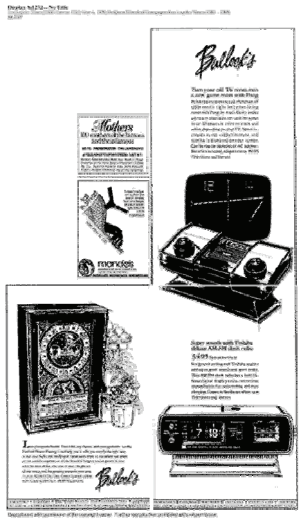
Figure 5: Pong advertised alongside an alarm clock and a gardening clock [4].

In April of 1976, another version of the ad appeared in the Los Angeles Times with the same text but featuring a drawing of the scene rather than a photograph. Along side this ad, the May Department Store running the ad also chose to run ads for their "spring sweater set" and a "Tummy Trainer Belt" that buzzed when you forgot to pull in your slouching tummy (see figure 4). A month later, in the Los Angeles Times, Bullock's Department Stores featured their own Pong ad that featured an illustration of the system and the television screen (see figure 5).