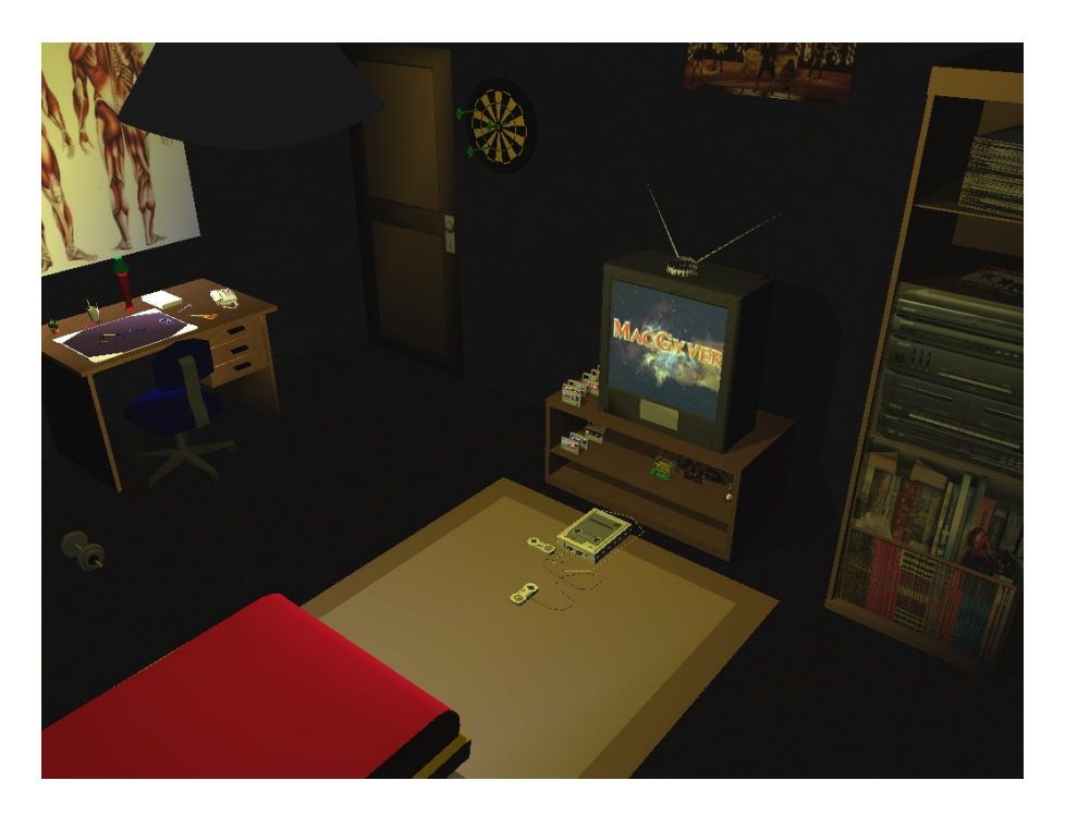
Figure 1: First atmosphere (a bedroom in 1995).