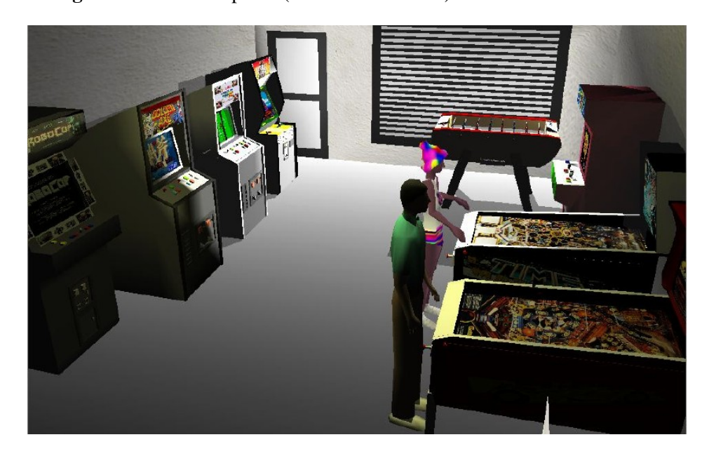
Figure 2: Second atmosphere (a small game room in 1989).