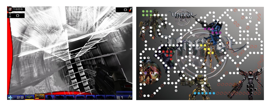
Figure 4: "Desimulat" by Valentina Vuksic and "MÄDUnreal" by Synes Elischka.

Both of these examples distorted the game in ways that it still retained its core characteristic, but got enriched by being combined with other cultural artifacts.