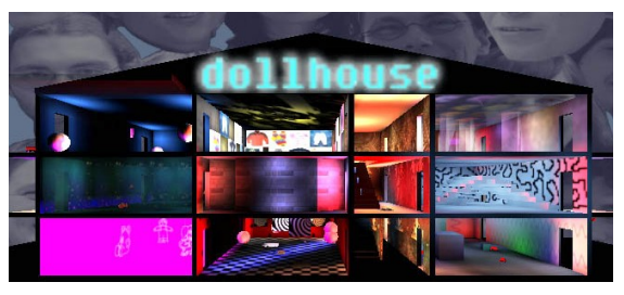
Figure 5 : The dollhouse after the first and after the fifth day of collaboration.