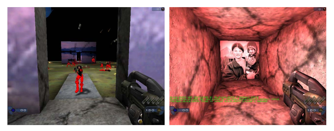
Figure 3: "Go with the Heart" by Eleni Laperi and Elona Hasko.

The resulting levels blurred the boundary between game and reality in different aspects. There were frightening correspondences in the rules of the game and blood feud. Importing imagery from the actual Albanian location situated the levels in a specific geographic context. And it became possible to experience a desperation similar to the desperation affected families are dealing with.