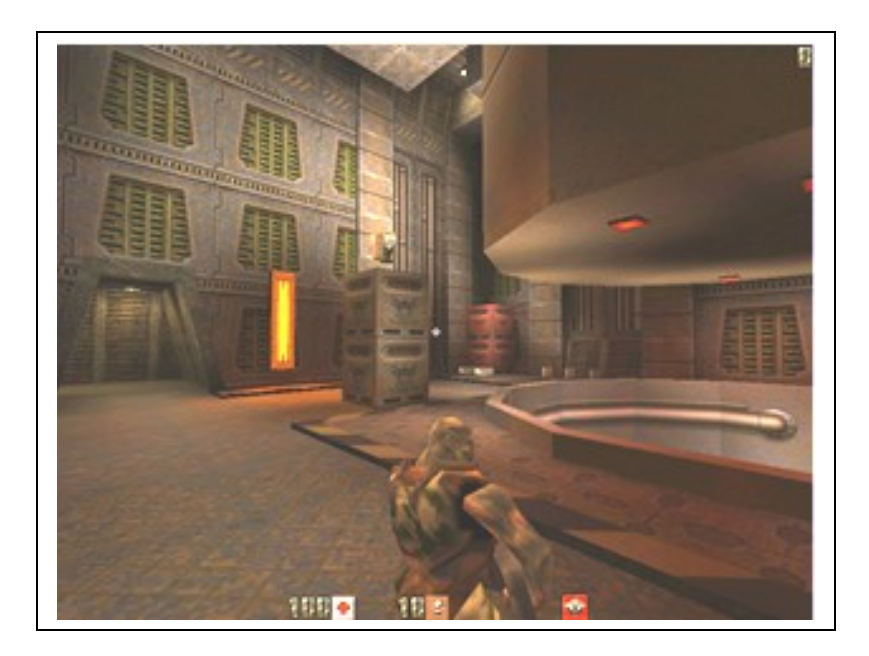
Figure 6: OTS CameraBot view

• OTS CameraBot (figure 6): An Over-The-Shoulder CameraBot is used for, among other things, navigation of the game world.