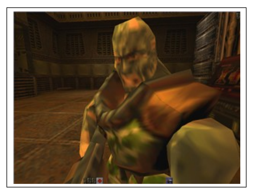
Figure 4: Close-Up CameraBot view

• Character CameraBot (figure 3): A Character CameraBot shoots long shots and medium shots but not close-ups.