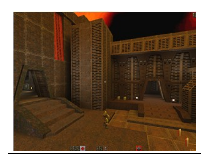
Figure 2: Establishing CameraBot view

decides they are to be filmed, ensures that the necessary CameraBots are in the game world and provides them with instructions. There are a number of different CameraBots that may be selected and each specialises in providing certain views: