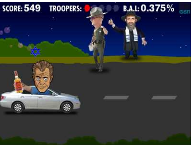
Figure 1: The political cartoon (left) and computer game (right) describing Mel Gibson's run in with the law do little more than summarize the news event in a humorous way [16].

the characteristics of a good Political Cartoon [24]. By trivializing the specific current event, the author uses the story as a tool to make a statement of lasting significance about the media's obsession with celebrity culture. The cartoon does more than merely summarize the event with caricatures as seen in figure 1.