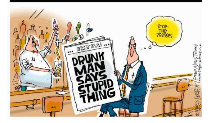
Figure 2: A political cartoon that uses trite subject matter to make a statement of lasting importance [15].

even more impactful commentary than the best political cartoons on the subject (figure 3). In Kabul Kaboom, created by newsgame founding father Gonzalo Frasca [25], the player's goal is to collect food falling from the sky while avoiding falling bombs. After playing for a short while it becomes clear that there is no way of winning this game. The game always ends in failure. This guaranteed failure, initially unknown to the player, allows the player to discover and experience firsthand the author's opinion about the event it simulates. This authorial device has been previously been referred to as the rhetoric of failure [5]. This differs from So you think you can drive, Mel? in how it makes its editorial opinion known through visuals, audio and through the act of playing the game. With Kabul Kaboom, Frasca demonstrates how authoring game rules and mechanics can serve as an additional rhetorical outlet, and in this case is how this game provides deeper commentary than the related political cartoons (figure 3). This game serves as an example of how newsgames have the potential to communicate and persuade players in ways that political cartoons are unable to do.