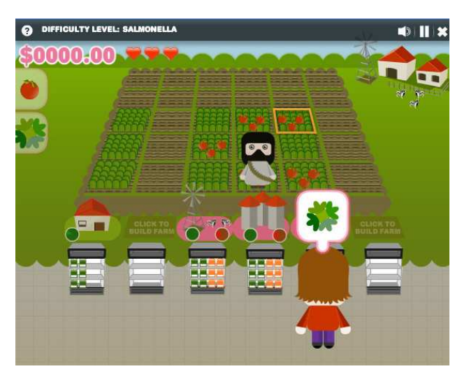
Figure 4: Bacteria Salad makes a sophisticated procedural argument against large scale agribusiness.

In summary, below is a list of criteria that describe an ideal newsgame as follows from the comparison of newsgames to political cartoons: