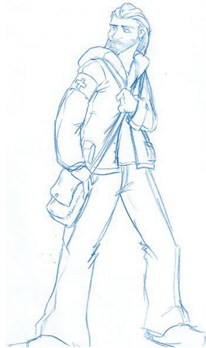
Figure 5: The male “Dox”