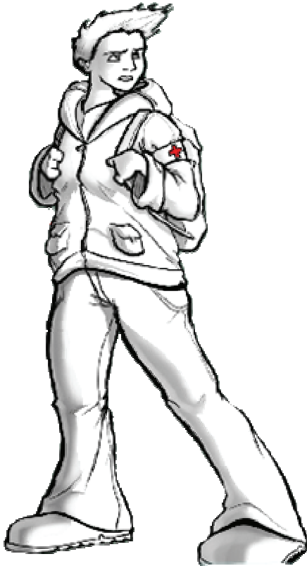
Figure 6: Re “Dox” – the final draft

Appealing yet again for a strong engaging and non-stereotyped female street doctor, we got, finally, in this third draft, a young woman with a hip, metropolitan look, now more wary than terrified, who is a bit more welcoming as a character. Note that in this final draft she has a somewhat androgynous look to her.