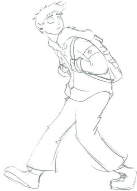
Figure 4: Third draft of “Dox”

And the third, when we asked for a more likeable character, one a young player might want to “be,” was rendered as a slight, visibly fearful, character likely to inspire pity and protection for her vulnerability, rather than confidence in her skill and courage. The contrast is marked in relation to her strong, savvy, streetwise male counterpart.