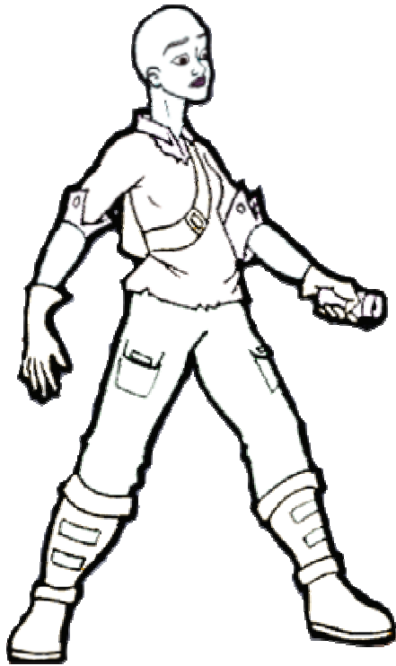
Figure 3: Second draft of “Dox”

The second was a stronger character, but rendered without hair, and looking very much like a victim of contagious disease herself.