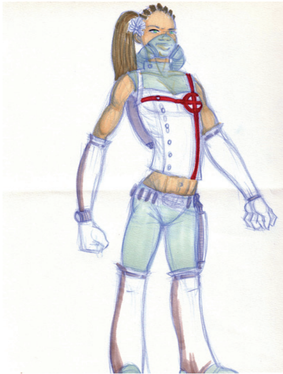
Figure 2: First draft of “Dox”

The second was a stronger character, but rendered without hair, and looking very much like a victim of contagious disease herself.