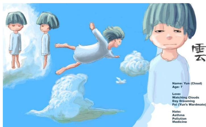
Figure 5: Cloud , an experimental mechanic involving complex emergent cloud formations and fantasy play.

Cloud is the second game funded by the grant, and its team is also made up of students from the School of Cinema-Television and the Viterbi School of Engineering. This game concept pushes the envelope play. In Cloud , the player can fly up in the clouds and change their shapes, gathering clouds and building cloud formations. This simple, fantasy mechanic evokes our daydreams as children, wishing we could fly up into the clouds and play. For the development team, Cloud is a rich area of exploration into emergent environments and innovative design.