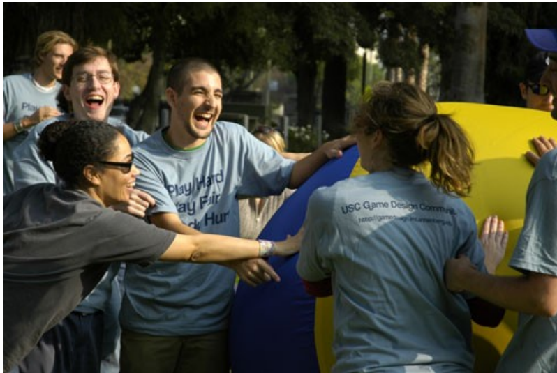
Figure 1: A spirited Earth Ball game at the USC New Games Day.

By holding more cooperative play events the community hopes to keep this important discussion open and improve the meta-discourse regarding the social mechanisms of digital games and how they can be improved for more quality social interaction – for both players and development teams.