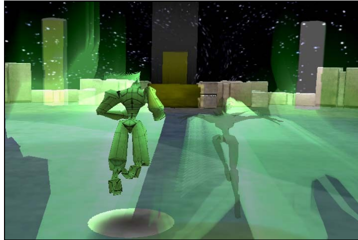
Figure 4: Dyadin , a cooperative action puzzle produced collaboratively by Interactive Media and Computer Science students.

closer or farther away from the other character to change color and affect objects in the space. Players must cooperate or they cannot escape the puzzle and combat based levels.