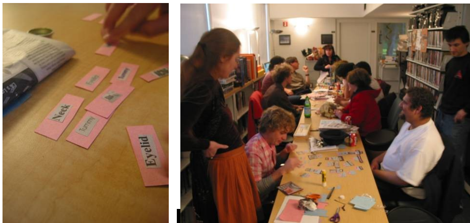
Figures 2 and 2a: Making and playing games using Surrealist techniques.